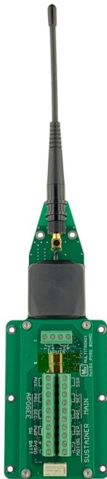
Mx152 Option-20 2.7" x 12.8" $1250