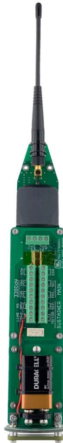
Mx152 Option-10 1.9" x 16.1" $1275