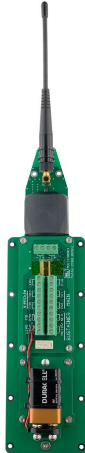
Mx152 Option-30 2.7" x 16.1" $1275

Option-1 is for upgrading an existing Mx150 "Kate 2.0" transmitter.